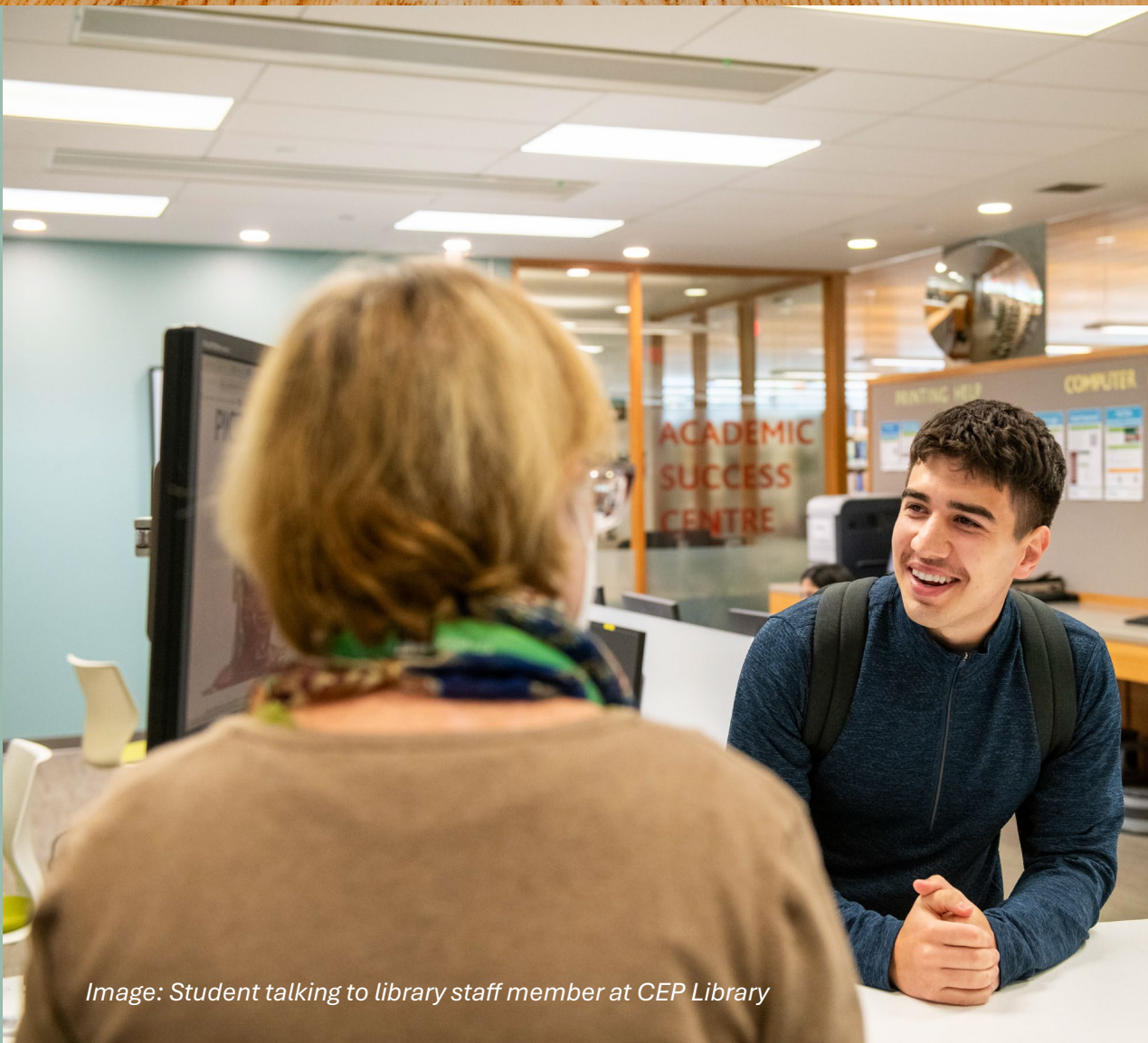
Image: Student talking to library staff member at CEP Library