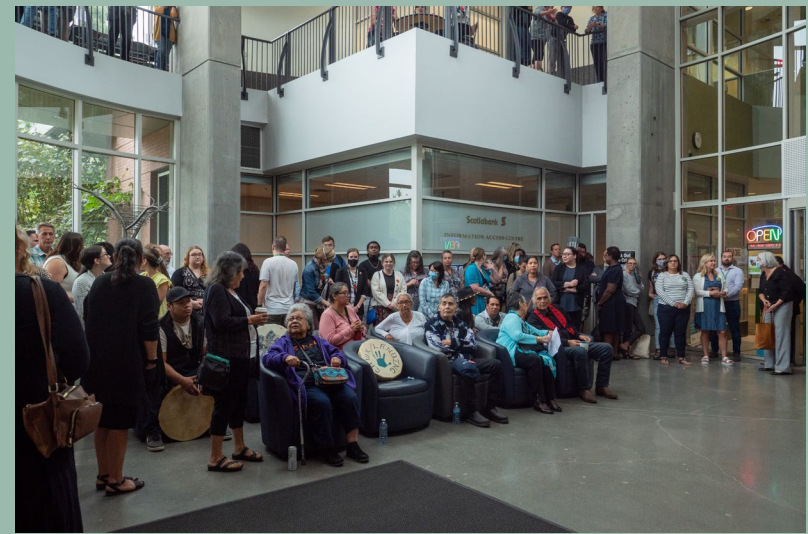
Image: Guests attend an event at Abbotsford Library