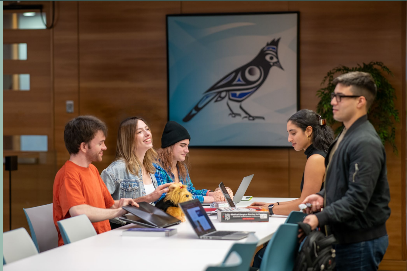
Image: Students at a study table at CEP Library