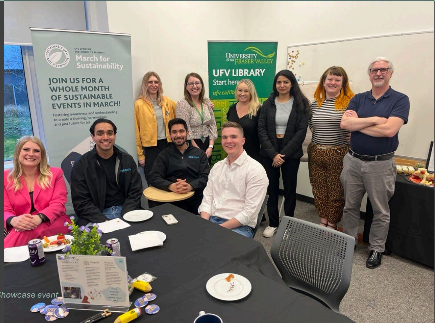
Image: Students, faculty, and staff at the 2025 Open Ed Week Celebration and Showcase event

UFV Library & TLC have hosted a series of funding opportunities for the creation of open educational resources including Open Education Micro Grant Programs and Open Education Faculty Fellows Program.