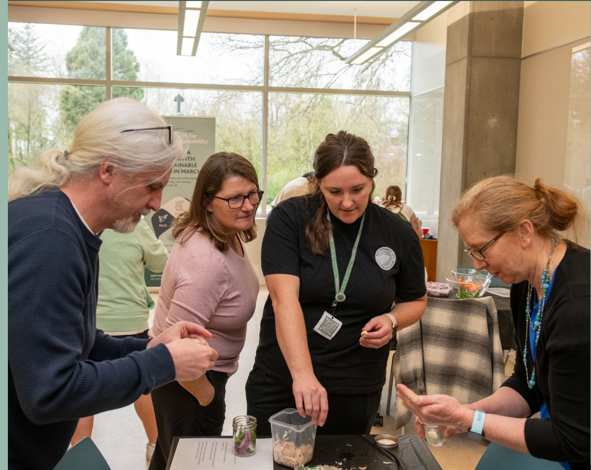
Image: UFV staff participate in the Bubbling Bliss Fermentation Workshop (2024)