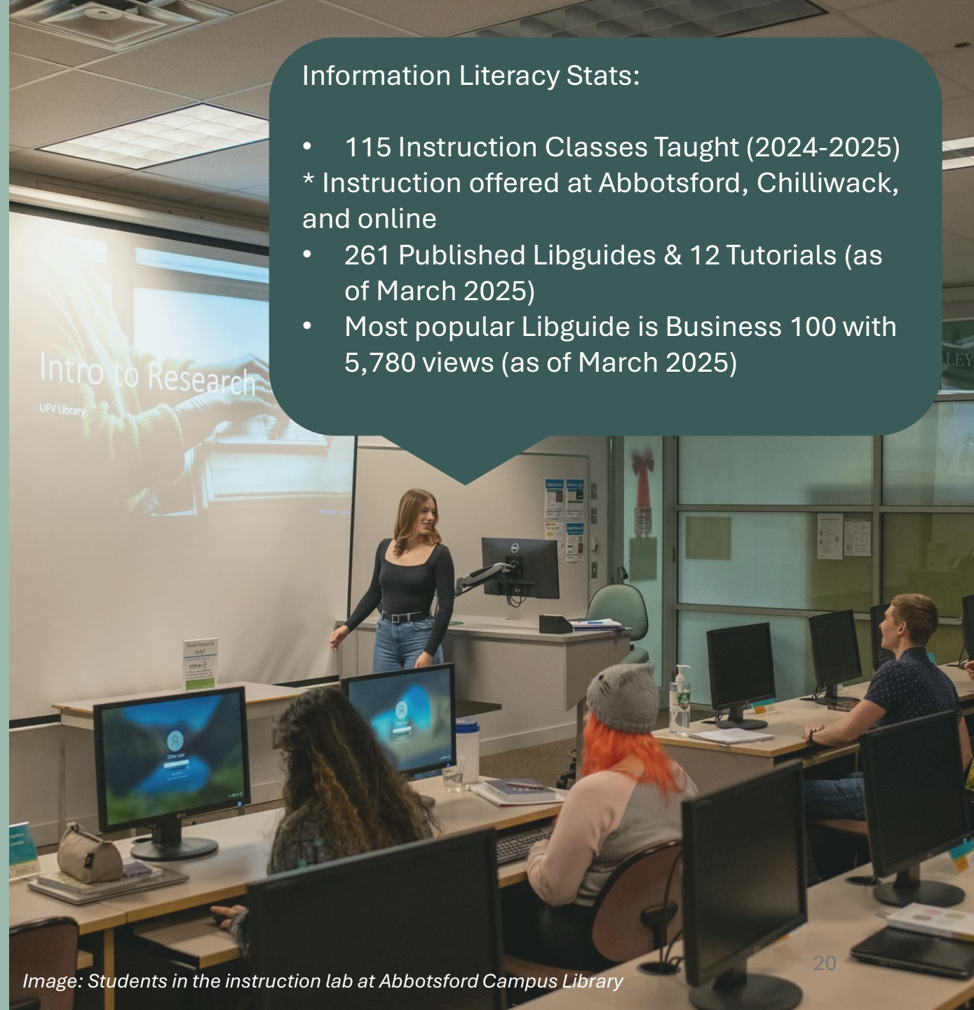
Image: Students in the instruction lab at Abbotsford Campus Library