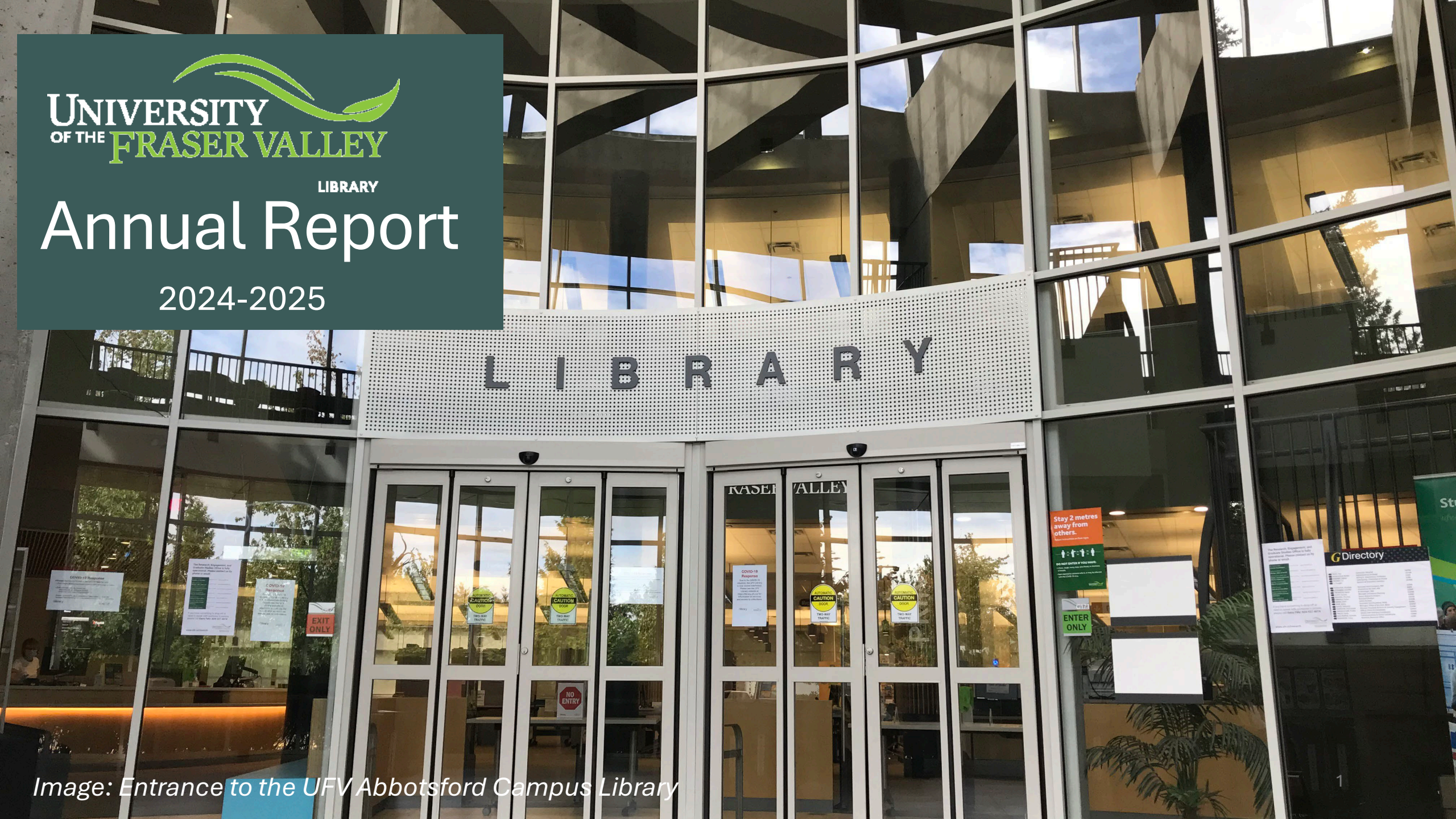
Image: Entrance to the UFV Abbotsford Campus Library