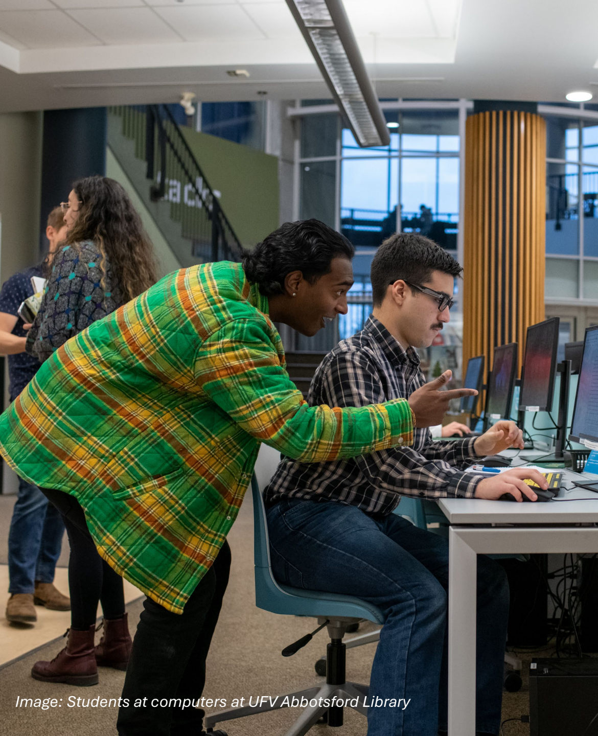
Image: Students at computers at UFV Abbotsford Library