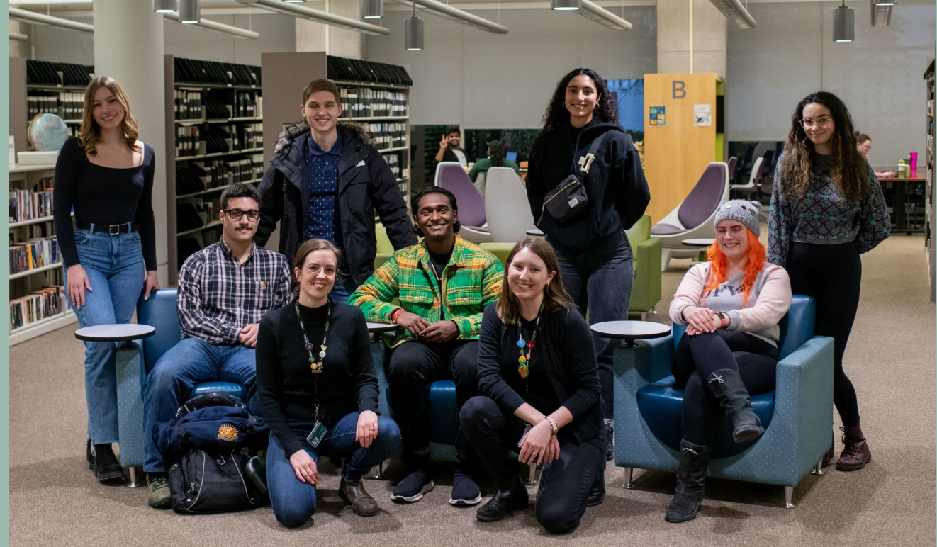
Image: Members of the inaugural SEWG with a few friends at first student photoshoot