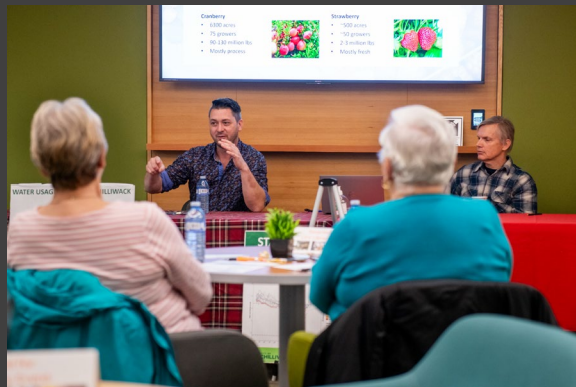
Images: 4 Science Café events at CEP Library

Science cafés provide a platform for research experts to share information on topics to the public. CEP Library hosts two Science cafes per semester to support our goals to engage learners, transform lives, and build community. Topics have included: