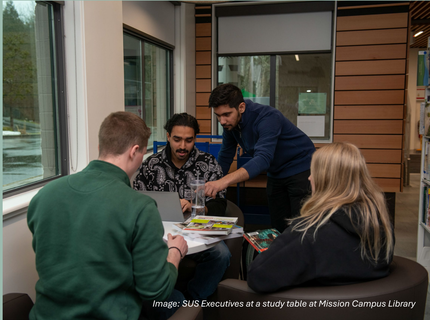
Image: SUS Executives at a study table at Mission Campus Library